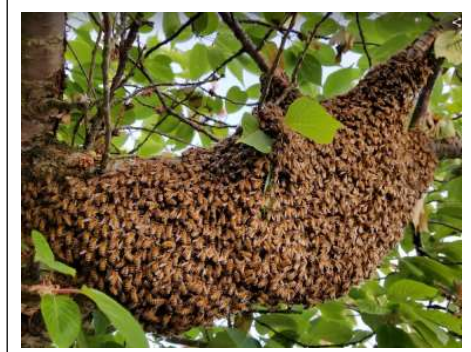
A honey bee swarm is a mass of bees hanging from a limb, branch, or other object.